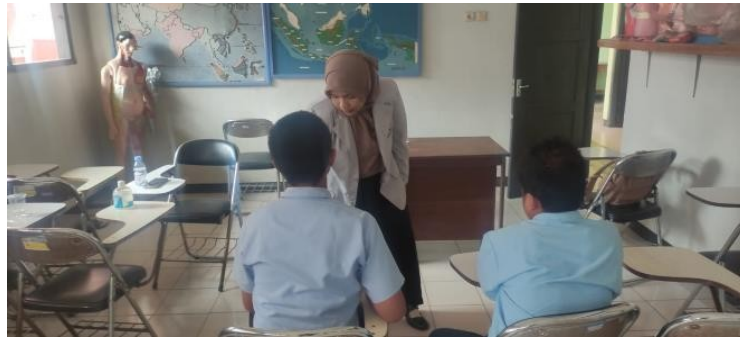
Fig. 2-Training in channeling emotions through the poetry therapy process for visual sensory disabilities in ppsdn pendowo, Kudus regency.

The storm blows, the wind blows But the steps do not retreat, the determination remains firm Searching for the meaning of life behind a dim career Traces left behind, scattered memories Laughter and tears are engraved in the heart Friends and comrades come one after another Teaching the meaning of life in every growth High mountains are surpassed, deep valleys are passed (Excerpt from a poem by AM (Beneficiary))