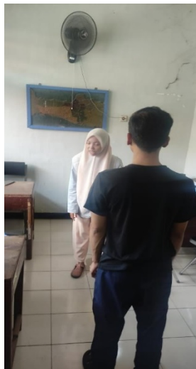
Fig. 3 - Training of thoughts and hopes through poetic expression for sensory disabilities visual at ppsdn pendowo, Kudus regency.

School, the place where I gained knowledge, has now become a nightmare. No longer cheerful, only the shadow of fearlooms. My desire to learn is suppressed by fear. Lost spirit, sinking into the abyss of silence (Excerpt from a poem by AM (Beneficiary))